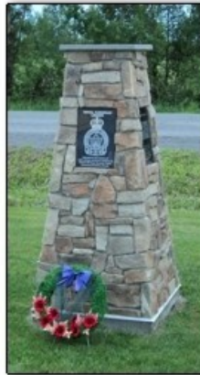
Branch 625 Richmond