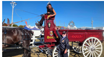
Second place above left. Third place above right.