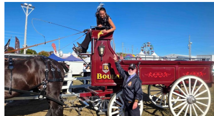
Second place above left. Third place above right.